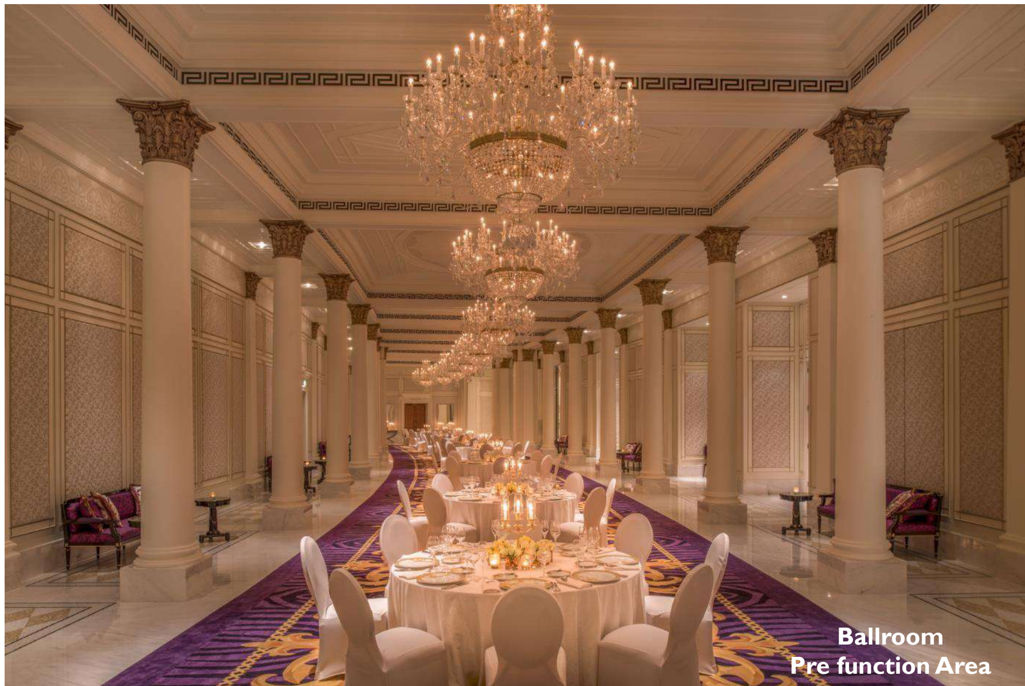
Ballroom Pre function Area